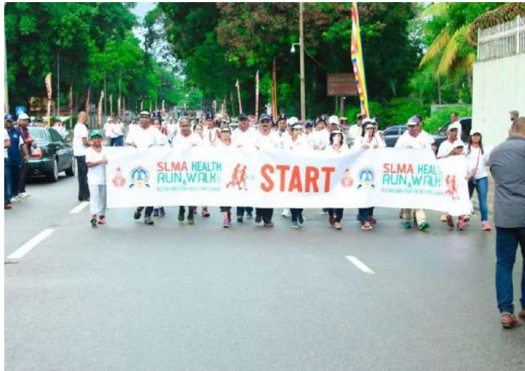
Sri Lanka Medical Association nationally holds 'SLMA Health Run and Walk' for general public

There have been sub national level awareness campaigns to promote PA led by NGOs. For example, Sri Lanka Medical Association conducts national events and NIROGI Lanka project has implemented physical activity promotion programs at selected settings. In addition, various professional colleges have been focusing on promotion of PA through their annual walks etc.