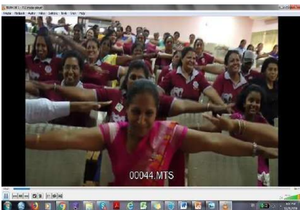
International Women's Day Programme