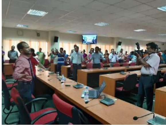
Awareness on exercises at a Multi-Sectoral meeting at Divisional Secretary Office