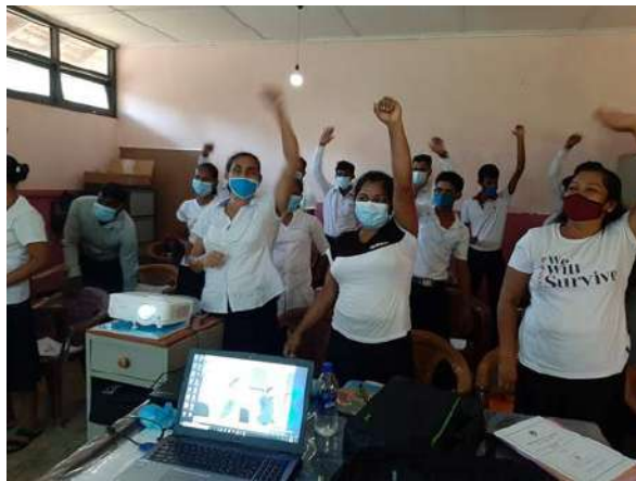
Awareness on exercise for newly recruited government employees