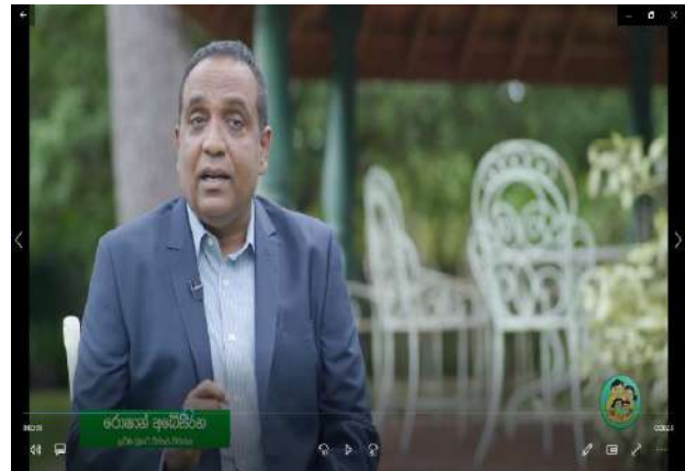
Production of Videos with Celebrities