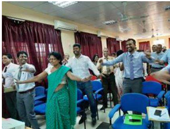
Taking active breaks during a monthly conference at a Medical Officer of Health Office