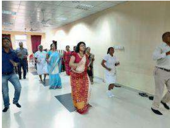
Awareness on exercise for staff at Regional Director of Health Services Office