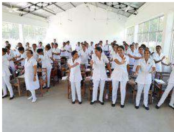
Introducing active breaks for student Public Health Midwife Training