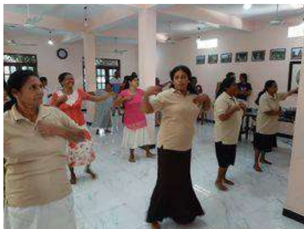
Awareness on exercise for a Mother Support Group at a Medical Officer of Health Office