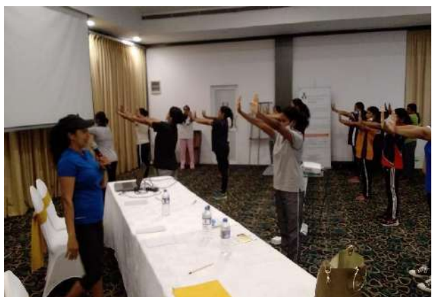
Programme for Women Development Officers