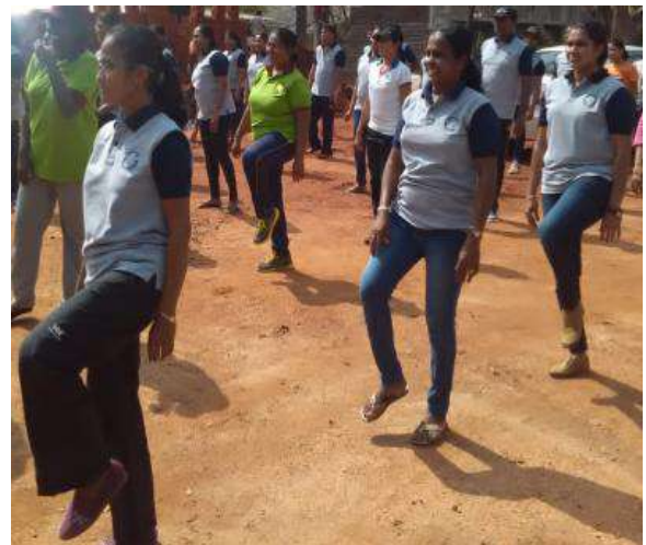
A mass participation event organized by a MO NCD to promote cycling and physical activity among health staff in her district