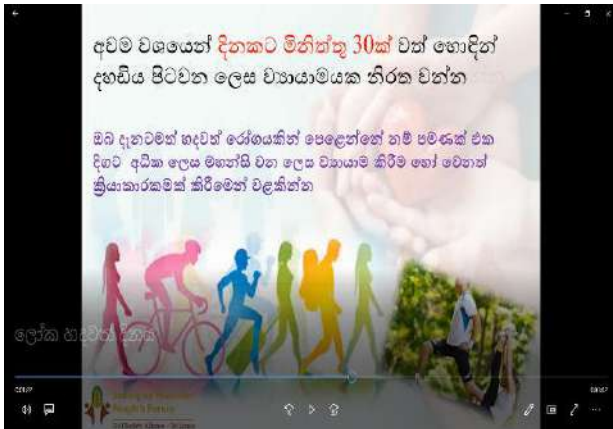
Social Media Campaign

SUN People's Forum is a NGO working closely with Civil Society Organizations (CSO) to promote nutrition and physical activity among the Sri Lankan population. They have been involved in awareness creation on physical activity among various difficult to reach communities.